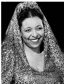
Ethel Waters in 1943

Ethel Waters (1896-1977), who began her career as a blues singer, was the first African American to star in her own television show, the first African American woman to be nominated for a Primetime Emmy award and to star on Broadway, and the second African American nominated for an Oscar. A movie star and recording artist, Waters was a mid-twentieth-century superstar.